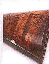
Even standard wood is well figured.