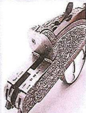
Copy to go here, copy to go here.