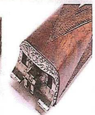
Splinter fore-end with Anson push rod.