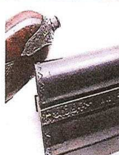
Chopper lump barrels.