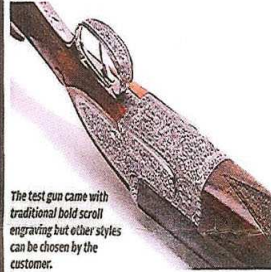
The test gun came with traditional bold scroll engraving but other styles can be chosen by the customer.