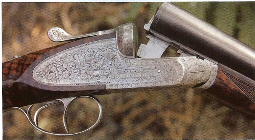
The new Pall Mall incorporates traditional scroll pattern engraving.