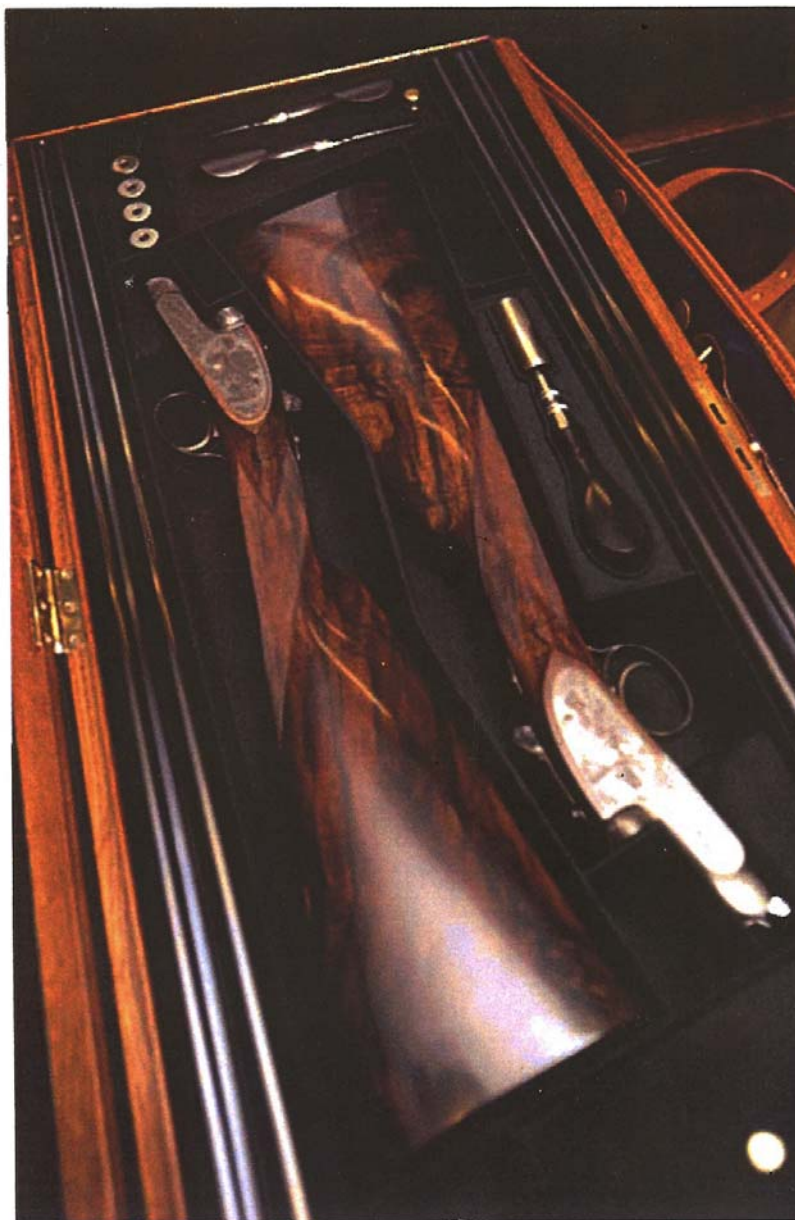
A good presentation case can add value to a pair of guns and also aid in the speed of their sale.