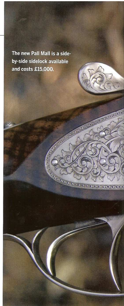
The new Pall Mall is a side-by-side sidelock available and costs £15,000.